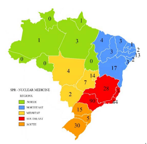
Figure 3: Regional distribution of Nuclear Medicine RPS<sup>11</sup>.

Nowadays, it is necessary a minimum experience of 3800 hours in the chosen area (initiated after the undergraduate program be concluded) in order to comply to the ABFM specialist certificate<sup>12</sup>. Currently, according to ABFM<sup>12</sup>, there are 306 specialists in RT, 82 in RD and 42 in NM, distributed over the geographical regions of the country (Figure 4). It can be highlighted the predominance of certified physicists in the southeast region.