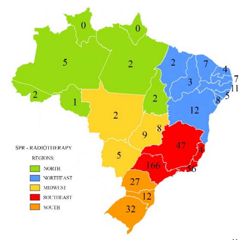
Figure 2: Regional distribution of Radiotherapy RPS<sup>11</sup>.

The recommendations for obtaining the Radiation Protection Supervisor certificate follow the regulation established in CNEN NN 7.01<sup>10</sup>. In order to be able to apply for the examination to become a SPR, the candidate must demonstrate at least 350 hours of experience in Radiotherapy and 200 hours in the area of Nuclear Medicine<sup>10</sup>. There is a total of 739 certified RPSs (295 in Nuclear Medicine and 444 in Radiotherapy) currently in Brazil, as shown in Figures 2 and 3<sup>11</sup>. It was possible to observe that the southeast region is the region with the highest number of supervisors (273 for RT and 165 for NM).