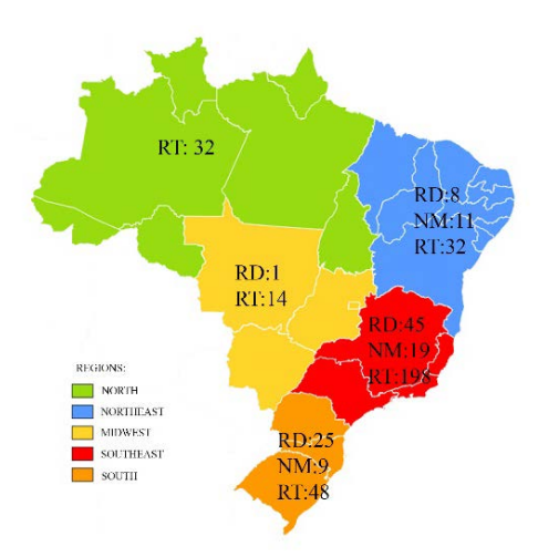
Figure 4: Regional distribution of ABFM Certified Medical Physicists ^{12} .

The Brazilian Association of Medical Physics (ABFM) was founded in 1969 by approximately 9 physicists and since then the number of members has increased considerably. The emergence of other undergraduate courses in medical physics, national congresses and specialist certification, the average membership increased from 8 per year until 1990 to 30 (up to 2001) and 54 (up to 2016). Currently, ABFM officially has 1345 active members. The temporal growth of ABFM members is shown in Figure 5.