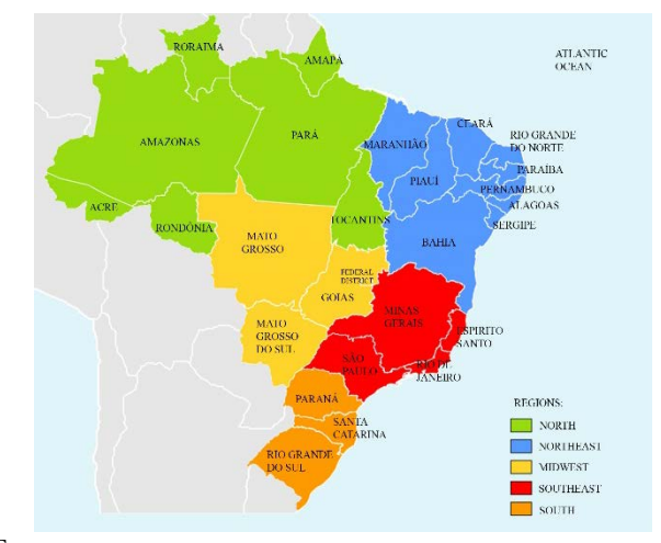
Figure 1: The five regions and 26 states and one Federal District of Brazil<sup>6</sup>.

The National Cancer Institute (INCA) estimates approximately 600,000 new cancer cases will be diagnosed in 2016-2017 in Brazil<sup>4</sup>. Therefore, it is evident the importance of early diagnoses and treatment, which consequently, raises the need for qualified Medical Physicists to assist on the quality improvement of the diagnostic facilities and treatment centers<sup>5</sup>.