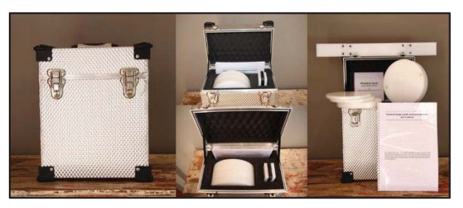
Fig. 2. The U-QA phantom package showing the phantom, user's manual and data analysis software in a travel case.

Data analysis software was developed for analysis of obtained images and a complete step-by-step user's manual was prepared. Reproducibility testing was performed on the phantom, using Department of Health (DoH) specified limits. Independent validation of the phantom package (Figure 2) (i.e. phantom, software and manual) was done by three independent medical physicists. They compared the phantom to the commercial phantoms in general use in their institutes.