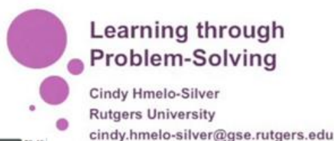
Fig. 4: Title slide of Cindy Hmelo-Silver’s presentation on “Learning Through Problem-Solving” at the 2010 AAPM summer school. © Cindy Hmelo-Silver

Do you recognize the already known keywords of modern style teaching in these titles: Neuroscience, Project-(also: Problem-)based Learning and Flipped (classroom) Learning. If you have not heard about these, here is a very