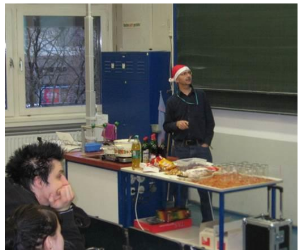
Fig.1: Teaching in the “classic style”: My Christmas lecture, where bored students are desperately awaiting the Glühwein to reach its drinking temperature.

experienced yourself in such lectures, it is the involvement of yourself and especially your thoughts and ideas, that will keep you awake.