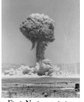
Fig 1: Nuclear explosion III.MEDICAL RADIATION EXPOSURE

Medical radiation exposures include the exposure of patients as part of their medical diagnosis or treatment, the exposure of individuals as part of health screening and program, and the exposure of healthy individuals or patients voluntarily participating in medical, biomedical, diagnostic or treatment research program. Medical exposure is more voluntary and mostly as accepted to bring more benefits than risk. Three general categories involve in medical radiation exposure are diagnostic radiology and image-guided interventional procedures, nuclear medicine and radiation therapy.