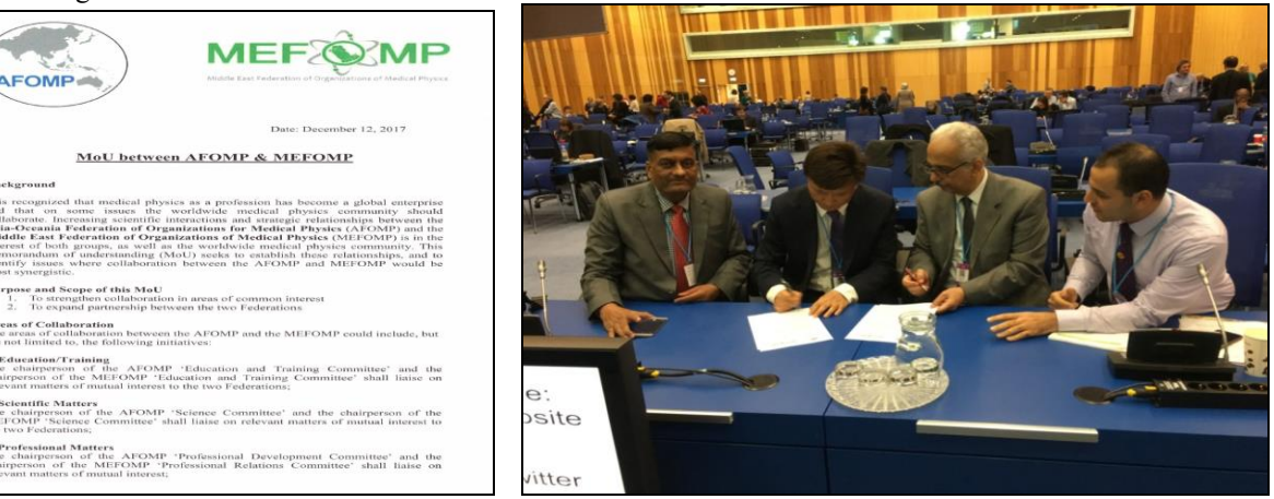
Photo of signing of agreement between AFOMP and MEFOMP- 12th December 2019 at IAEA HQ, Vienna, Austria

IOMP has provided valuable supports of various forms to AFOMP over the past twenty years. Likewise, AFOMP has participated and contributed to the work of IOMP and hosted World congress of Medical Physics and Biomedical Engineering [WC] on four occasions. Further, AFOMP medical physicists have served in various committees of IOMP, three of them served as IOMP Presidents and seven of them served as committee chairs. In addition AFOMP takes active participation in activities, programmes and initiatives of IOMP. Since the starting of IDMP in 2013, every year on 7th November AFOMP and its members celebrate IDMP to showcase the contribution of medical physicists. AFOMP actively contributed in developing theme and logo for IDMP. AFOMP participates and contribute in disseminating the IOMP publications such as eMPW, IOMP newsletter, circulars, information, notifications through AFOMP website and emails. The AFOMP website www.afomp.org is completely redesigned and launched in 2018 and is updated very frequently.