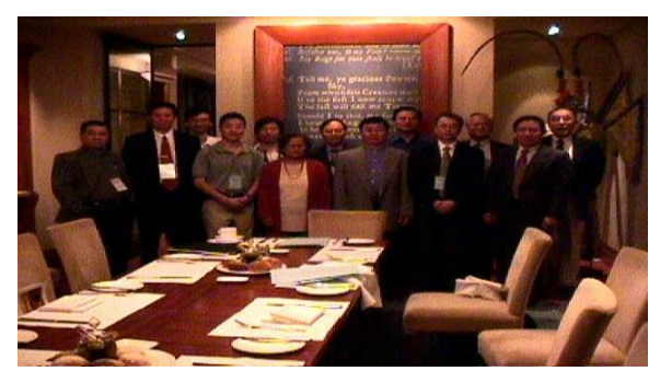
Photo of founding members of AFOMP [28th May 2000, Beijing, China]

IOMP council meeting held on 26 July 2000, admitted AFOMP as regional Organization [RO] of IOMP, third organization to be RO of IOMP [first was EFOMP, second was ALFIM]. AFOMP has widened its scope and today 19 countries national medical physicist Organizations (NMO) are members and 2 NMO's are affiliate members of AFOMP and represents over 11000 medical physicists from Asia-Oceania region.