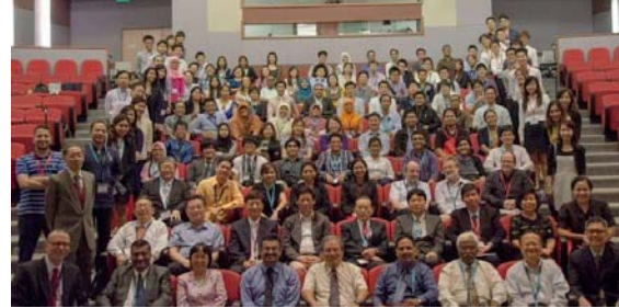
Fig.2 AOCMP/SEACOMP 2013 organized by SMPS