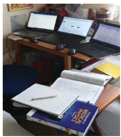
Fig.3 Work with several computers for the synchronized update of the Encyclopaedia second edition