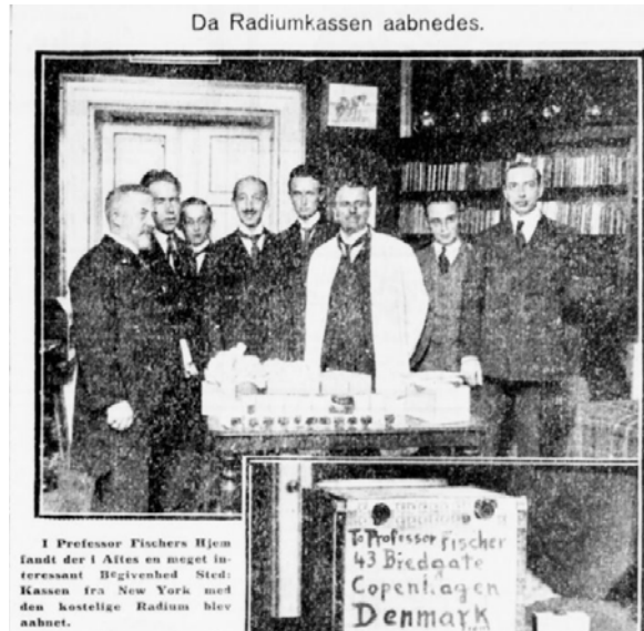
Fig. 1 Opening of the radium box, Dagbladet, October 21 1921.

The opening of the radium box was documented in a famous photograph (see Figure 1). Close to Bohr another scientist and Nobel laureate can be seen, Hungarian George de Hevesy, who was spending the first half of the 1920s at the Niels Bohr Institute. He went on to work with radioactive tracers to study biochemical processes, thus becoming one of the pioneers in nuclear medicine.