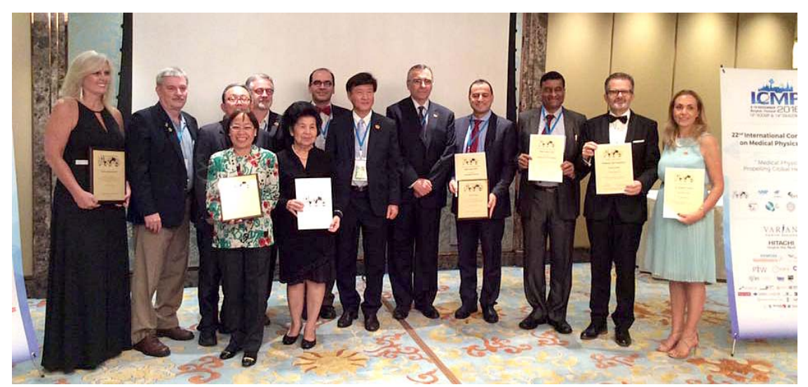
Fig.2 First presentation of IDMP Awards, Bangkok, 2016